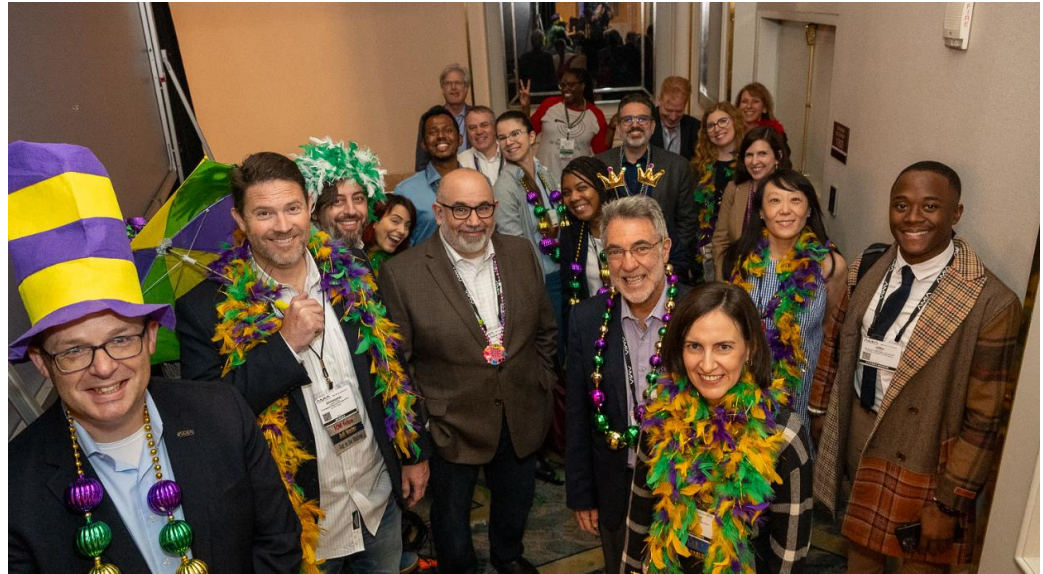
2023 AMIA - Inaugural Family Feud