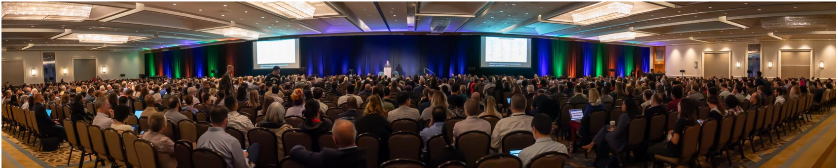
AMIA 2023 – Opening Session