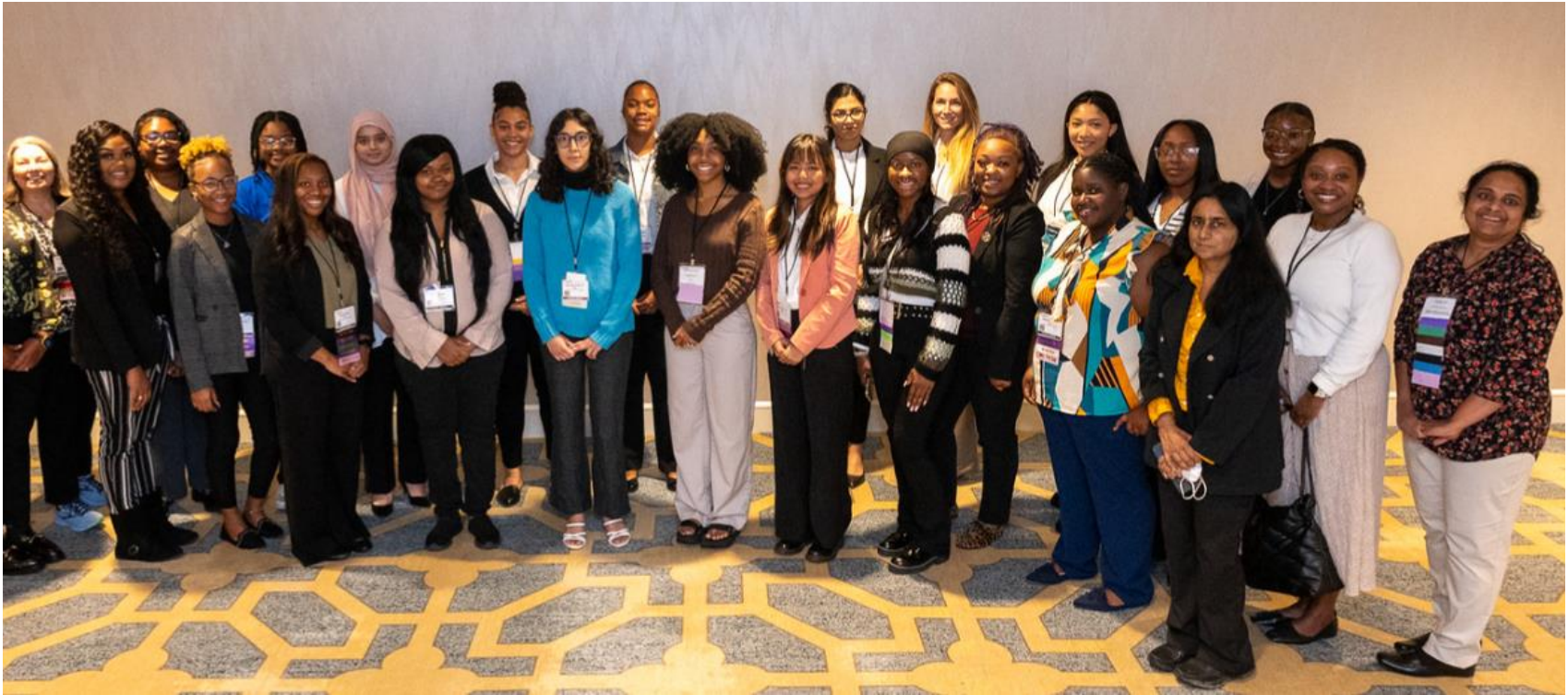
AMIA 2023 - First Look Program