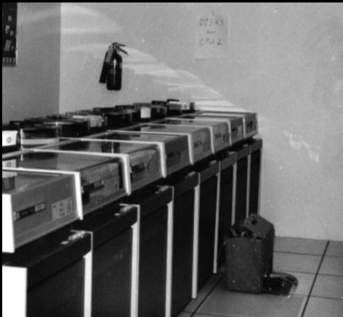
This is 50 megabytes of mass storage in 1970.